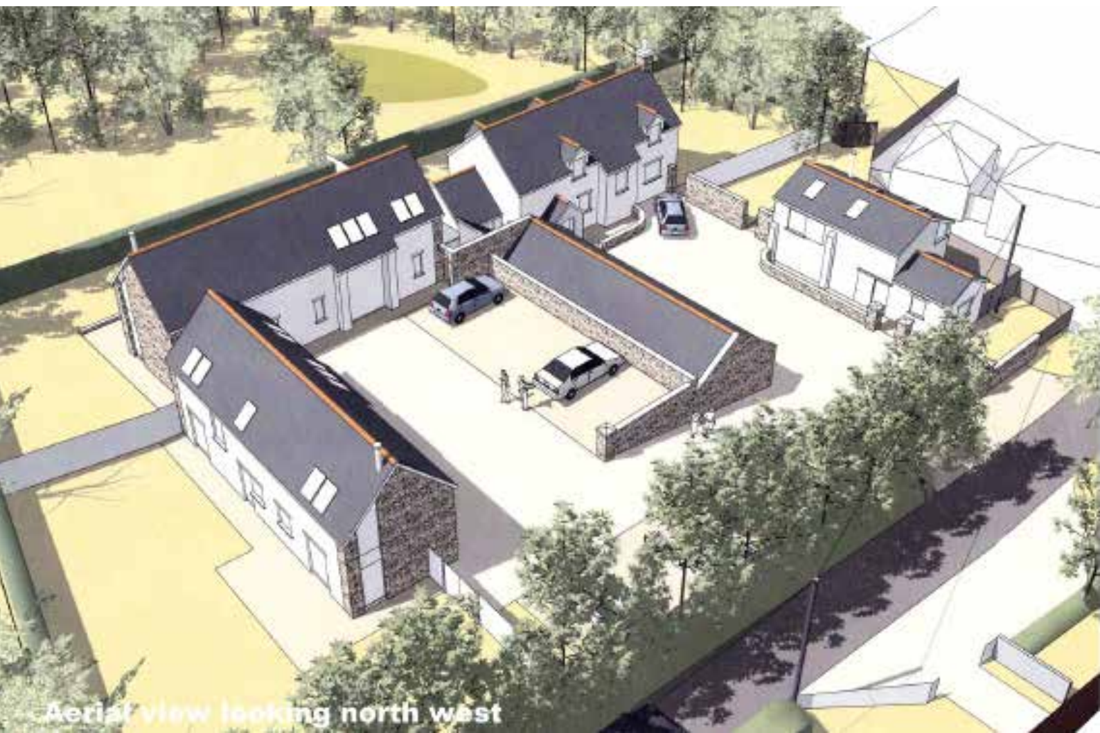
Aerial view looking north west